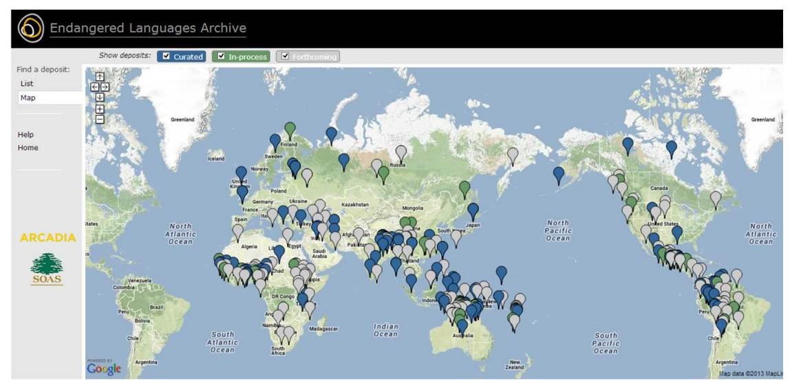
Figure 1: Map of ELAR-deposits as at August 2013

This level of funding had an influence on the topics that linguists (and others) chose to research, and the research methods they employed. The broader impact on the field of linguistics can be seen in the emergence of academic journals specialising in language documentation issues (Language Documentation and Conservation, Language Documentation and Description), specialist conferences, workshops and training courses (including InField and 3L summer schools, and the specialist MA and PhD programmes at SOAS (Austin 2008)), and a growing list of book publications on topics related to language documentation (for an annotated bibliography see Austin 2013).