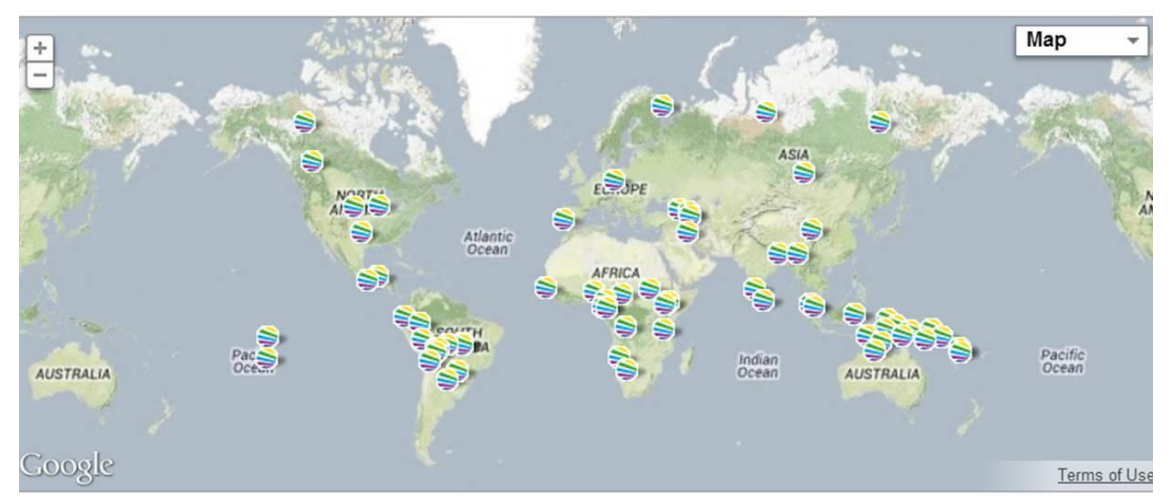
Figure 2: Map of Volkswagen-funded DoBeS projects